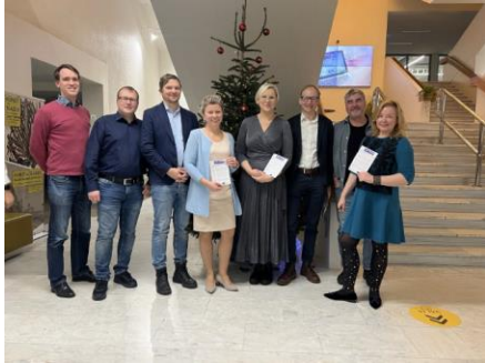
Advocacy Meeting in Estonia, 21.12.2023

including education and healthcare. Ultimately, advocating for trauma-informed practices to policymakers seeks to foster healing, resilience, and societal well-being by creating more compassionate and understanding communities.