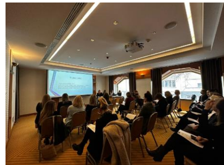
Advocacy meeting in Croatia

In Croatia the Autonomous Women’s House Zagreb organized the advocacy meeting with heads of services and departments of relevant institutions, academia and NGOs on 24 January 2024 in Zagreb, at the premises of Hotel Dubrovnik. The aim of the meeting was to inform the participants about Trauma-informed care approach and its relevance in daily work with women survivors , as well as to present the finding of research conducted in the scope of the project Care4Trauma. Finally, a set of recommendations resulting from research findings which were also completed with the feedback received from Women specialized services and NGO during the consultation workshop, were presented to the participants. The participants were invited to take part in the discussion about the policy recommendations and their future use in practice. A total of 26 participants attended the meeting which was held from 10:00 -13:15 hrs.