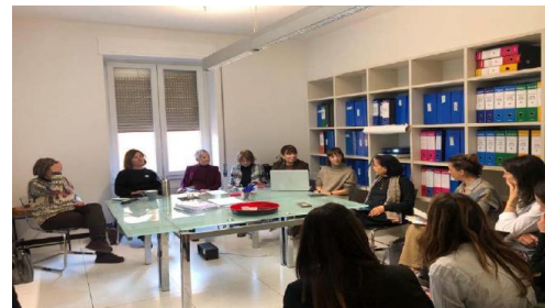
Advocacy meeting in Italy

Key recommendations for implementing trauma care approaches were presented through presentations, emphasizing obstacles and gaps in justice and social care systems. Additionally, participants were informed about the activities of Casa Phoebe , which stands out for its implementation of trauma-informed care.