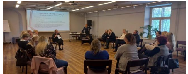
Training for Social Operators in Estonia