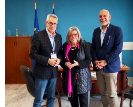
Advocacy meetings in Greece