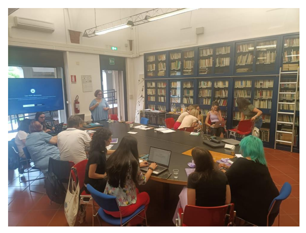
ToT for psychologists, 12<sup>th</sup>-16<sup>th</sup> June, Bologna, Italy

The main goal of the training was to encourage practitioners to be mindful and critical of their standard practices and of their knowledge transfer styles as trainers. The training was therefore intended to increase awareness among workers of the effects of trauma on women victims of violence and their children and to promote the dissemination of the approach in their workplaces. Furthermore, the course aimed to motivate trainers to find a means of embedding TIC effectively into their training initiatives with a special attention to the organizational cultures they belong to.